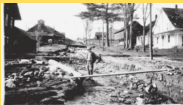
Town of Wheelock: Vermont's Gift to Dartmouth College Eleanor Jones Hutchinson

If it were still in use in 1927**, it is hard to imagine that this wooden structure was able to withstand the ravages of the historic floods that year. (**Can anyone confirm it?)