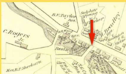
(The Peak Road bridge is to the left.)

If it were still in use in 1927**, it is hard to imagine that this wooden structure was able to withstand the ravages of the historic floods that year. (**Can anyone confirm it?)