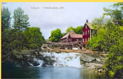
The bridge, no longer in existence, can be found on the Wheelock map in the 1875 Beers Atlas Caledonia County .