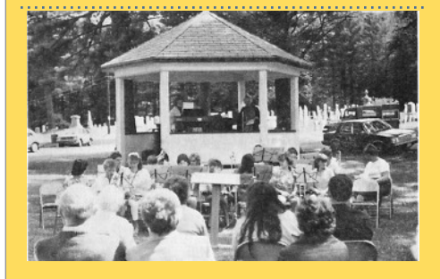
Photo and history notes from "Wheelock: Bicentennial Edition", Allis Beaumont Reid, ed., 1985 Wheelock Historical Committee

Built in 1976 for the bicentennial, the bandstand's construction was financed by local residents with monies raised from food sales, dances, and matching funds from the Vermont's Bicentennial Commission. Wheelock's current bandstand was not the first one to grace the village green.